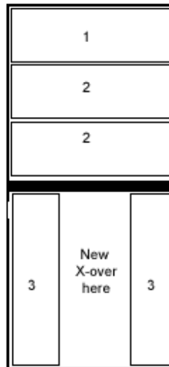
Left Side (diagram 1.1)

Bottom of third chamber in RS1000: # 6 flush with back